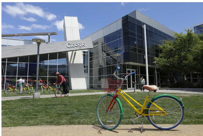
Google makes so much money that it is now worth three times more than every U.S. airline combined.

Monopolists lie to protect themselves. They know that bragging about their great monopoly invites being audited, scrutinized and attacked. Since they very much want their monopoly profits to continue unmolested, they tend to do whatever they can to conceal their monopoly—usually by exaggerating the power of their (nonexistent) competition.